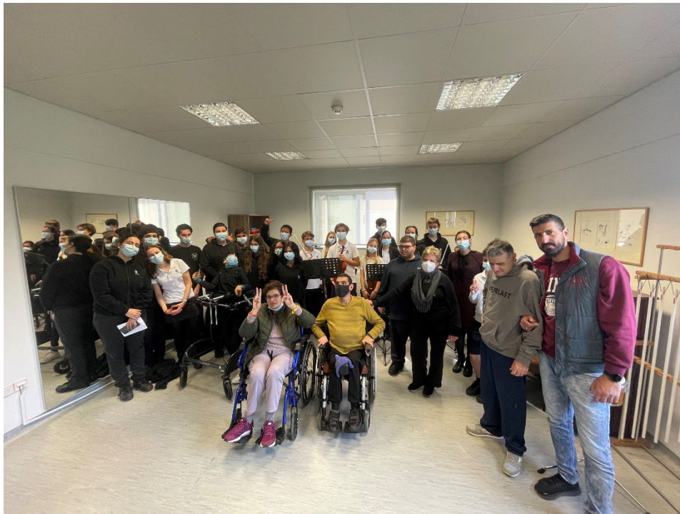
'Irida' visit a resounding success