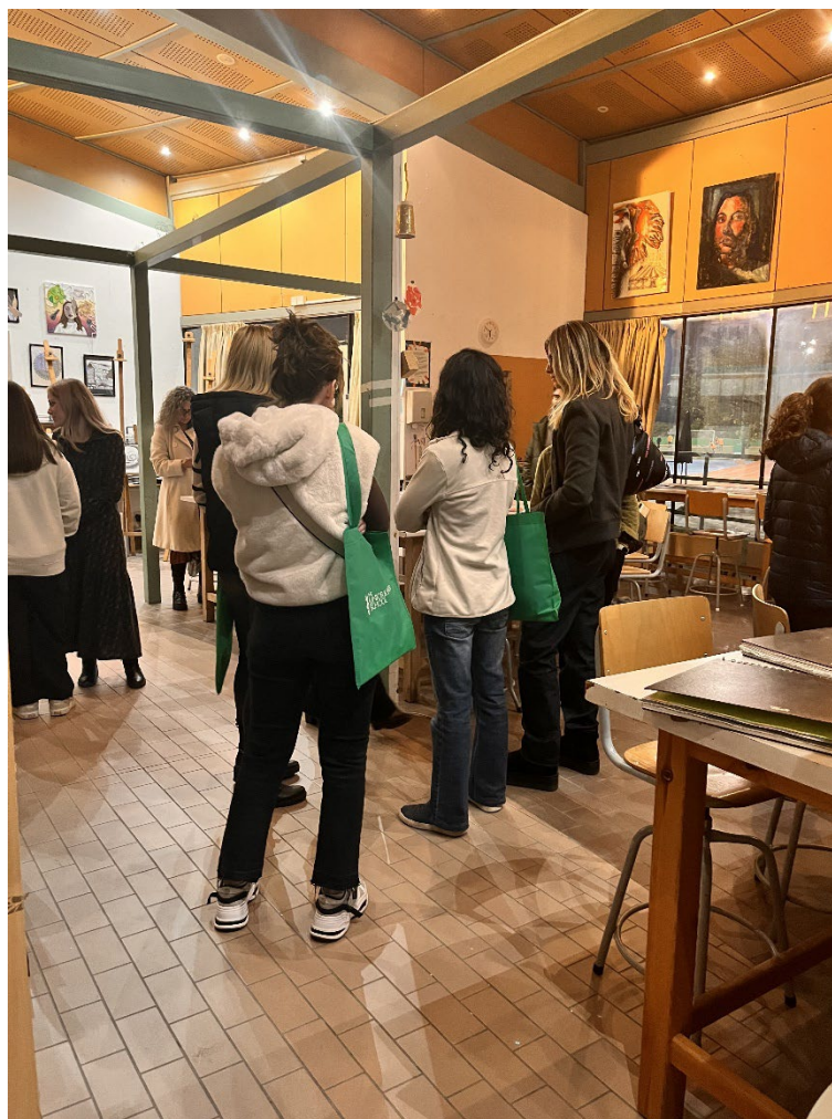
Parents exploring our Art department