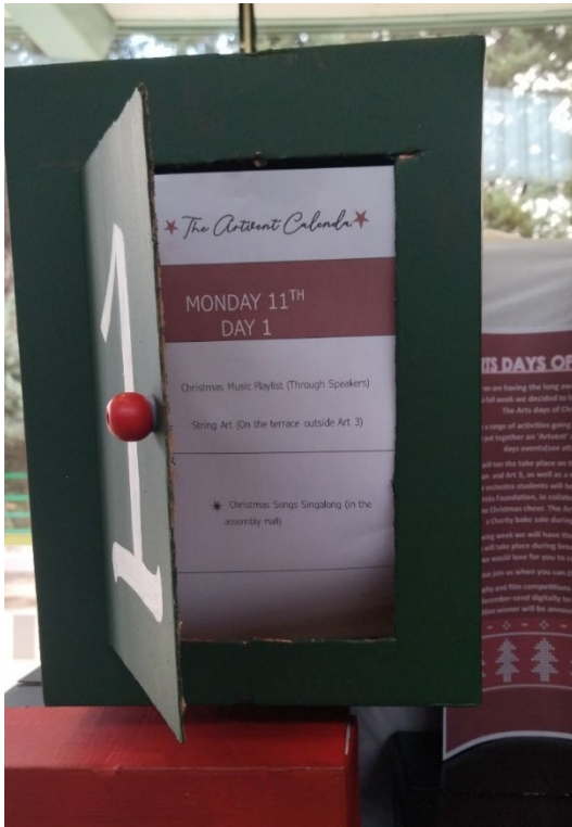
Advent Calendar – Day 1