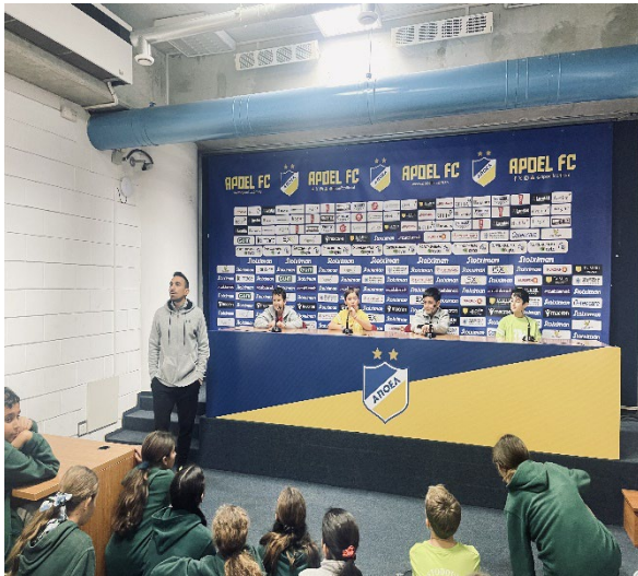
Year 6 acquire a taste of the experience of the stadium press room!