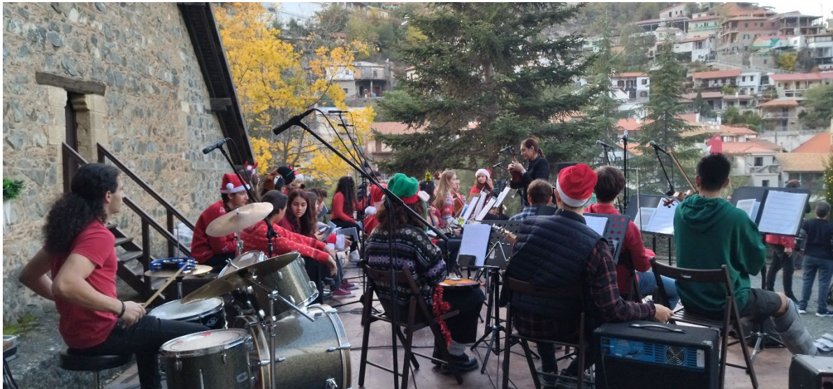
SS Musicians raise Christmas cheer at Kalopanayiotis