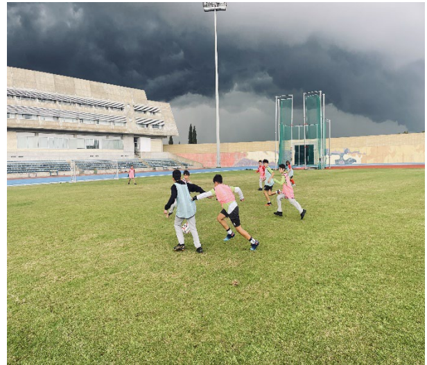
Dark, dramatic clouds, but a bright future!