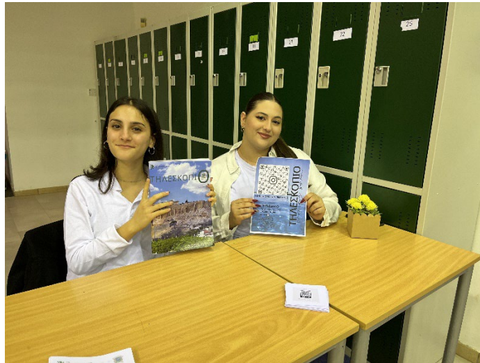
Issue 2 of the Greek Department Magazine – ‘Taleskopio’- on its way!