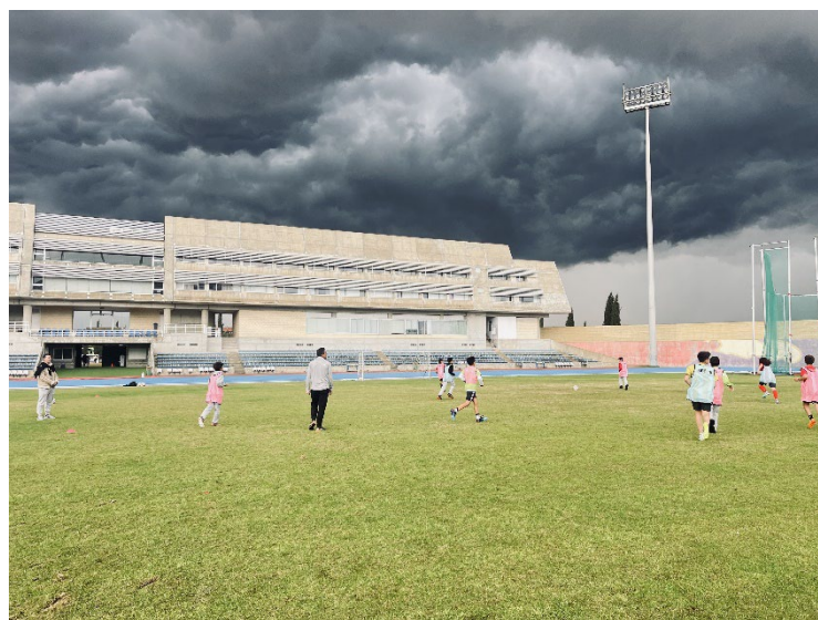
A slight chance of rain...