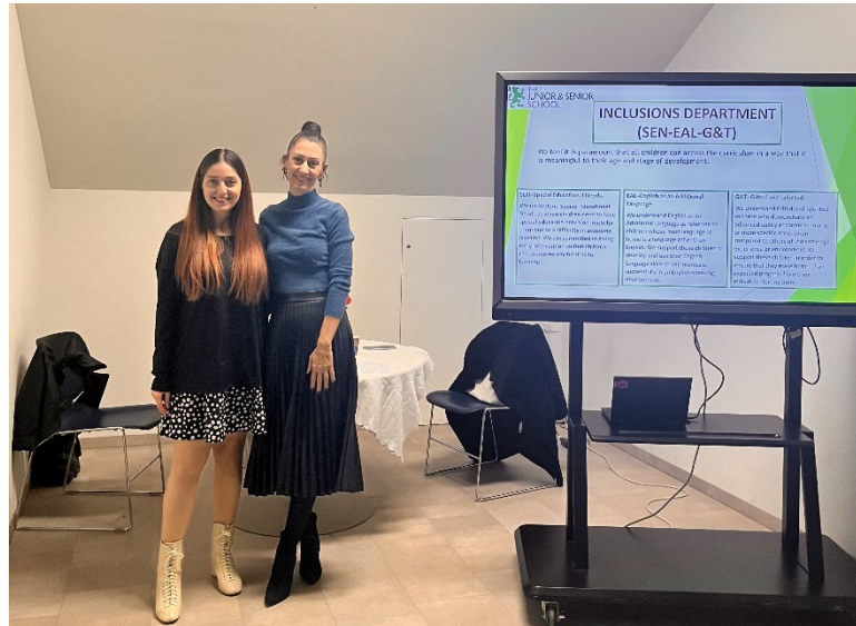
A friendly welcome from our Inclusions Department!