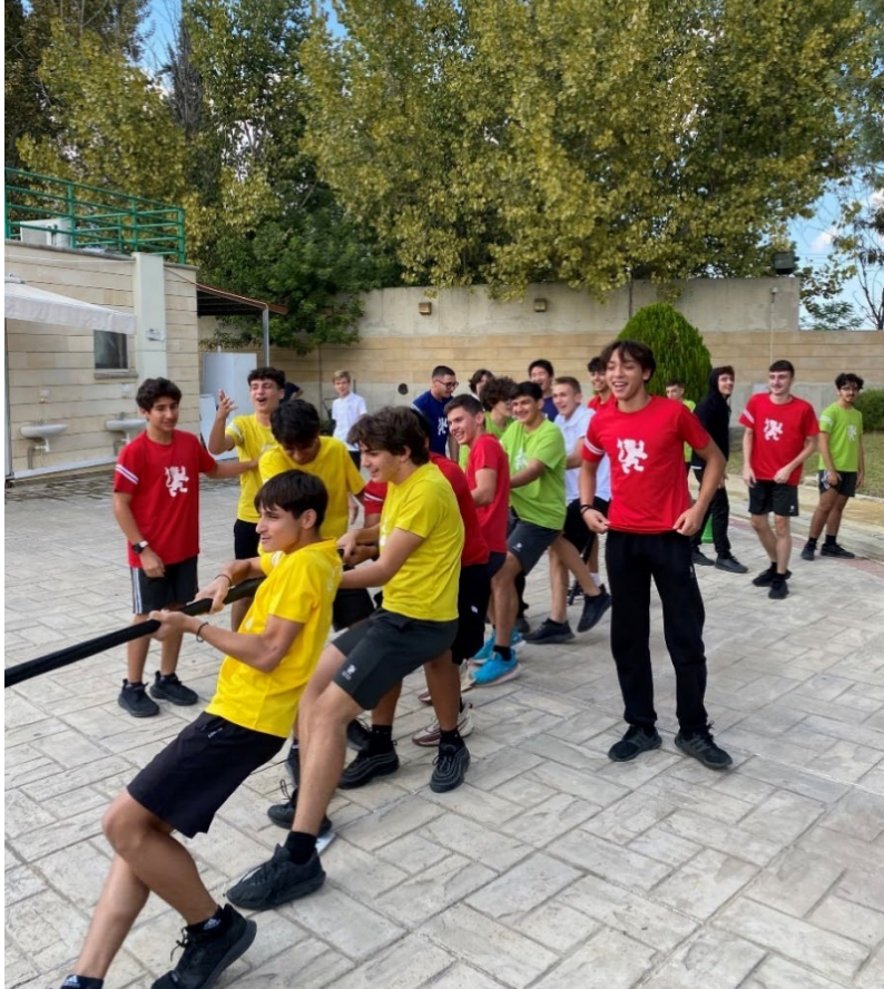
Year 10s enjoying an old-fashioned tug o' war