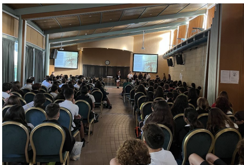
Respectful and attentive