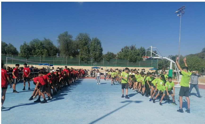
Team-building and competitive fun