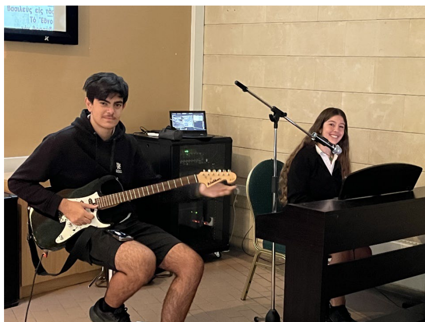
Thank you to our talented musicians