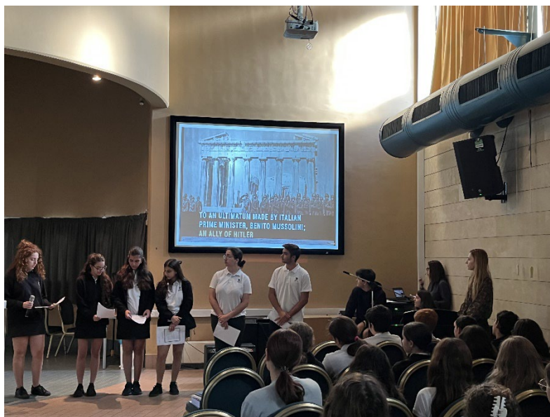
Students leading assembly commemoration