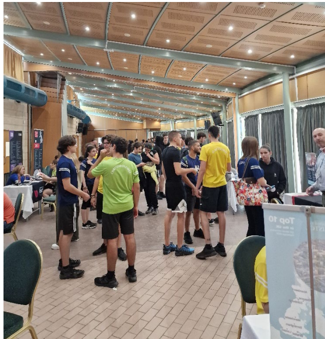
Mixing Founders' Day events with university enquiries!