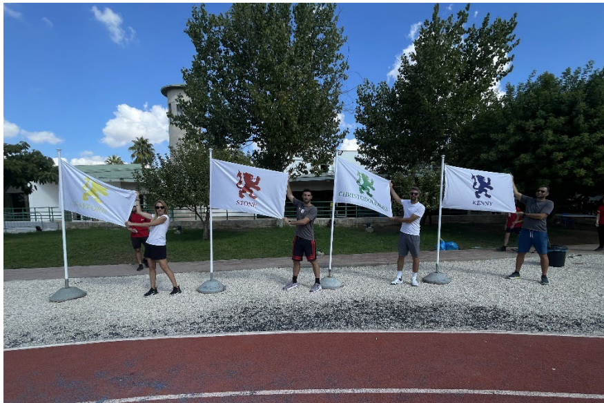
PE Department keep the flags of tradition flying