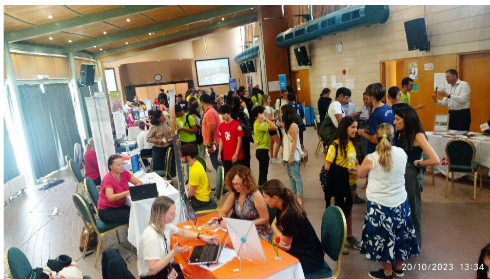
A busy scene in the Hall for the Uni Exhibit.