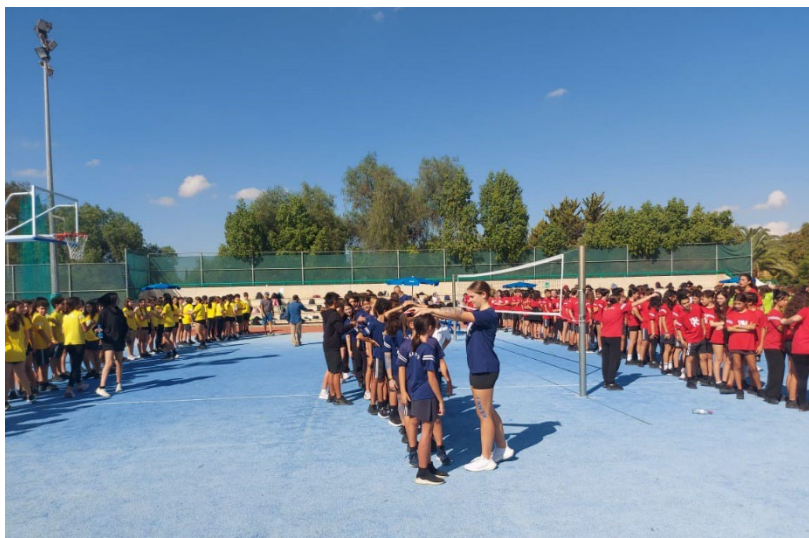
Sports Captains lead the way