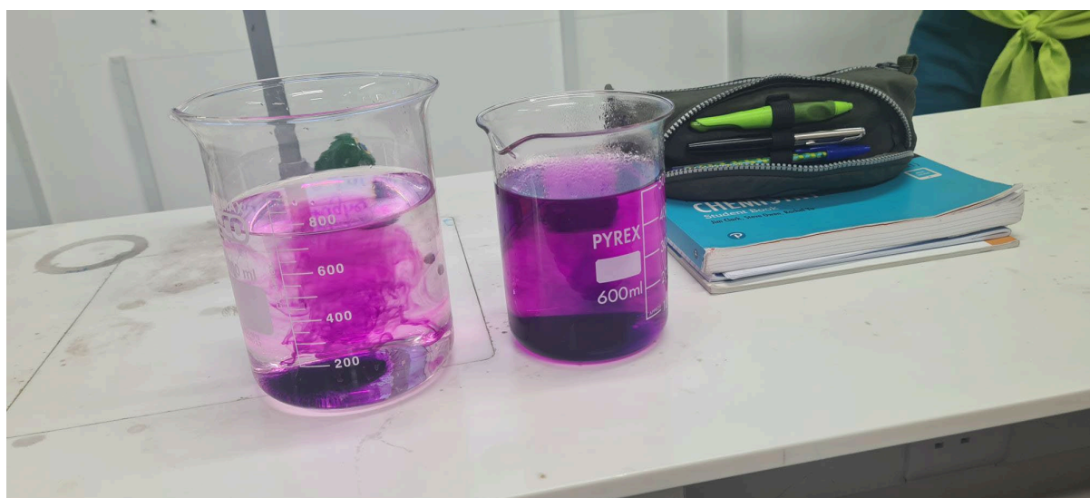
Investigation of the rate of diffusion of potassium permanganate at different temperatures