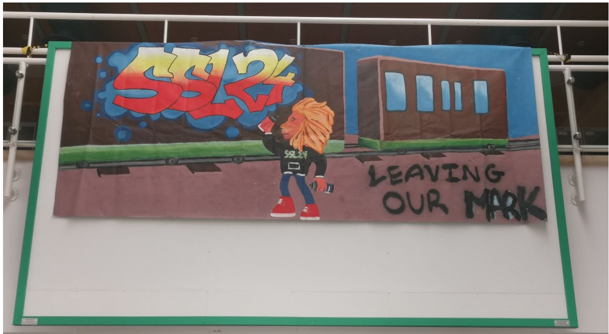
Year 13 (SSL24) on the mark...

We wish them the best of luck on this last leg of their journey with us!