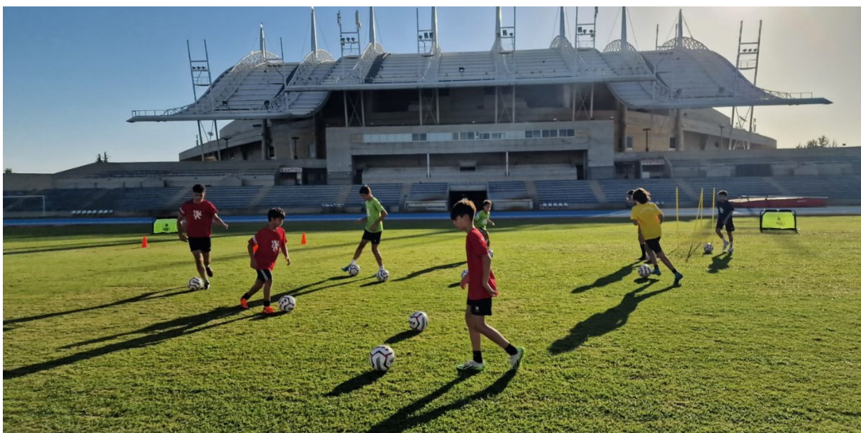
Season underway at the GSP stadium