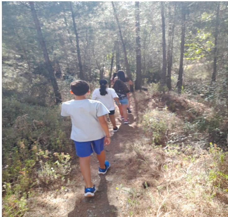
Orienteering in the wilderness

On Wednesday, 5 th September all Year 7 students spent their first day at the Senior School with their Form Tutors and their mentors. Students were led on tours of the school with their mentors, went through rules, expectations and procedures with their Form Tutors and had the chance to meet their new classmates as well as enjoying some team-building activities.