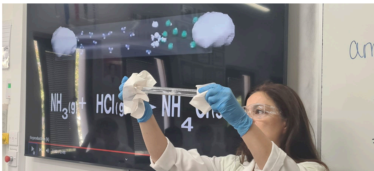
Reaction of ammonia and hydrogen chloride gases to form a white smoke of ammonium chloride

The Chemistry department is proud to share some photos of recent experiments in Year 10 Chemistry as well as to celebrate the excellent recent exam results: