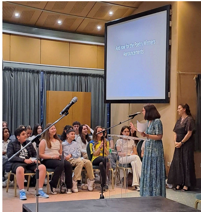
And the winners of the Poetry Competition are...