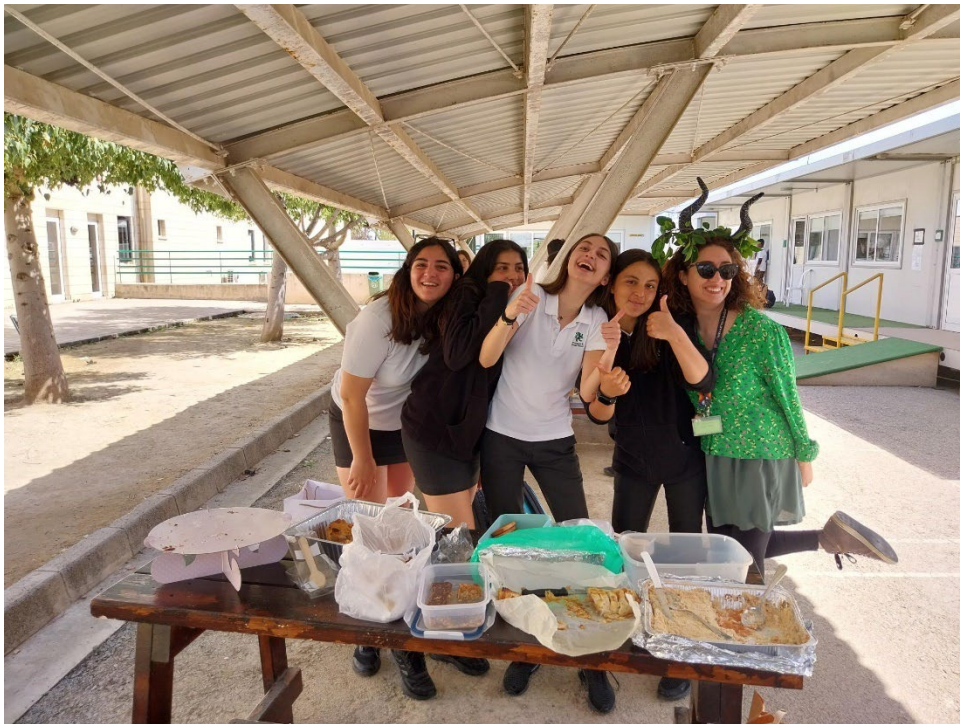
All proceeds for book buying! Thank you Year 9U!