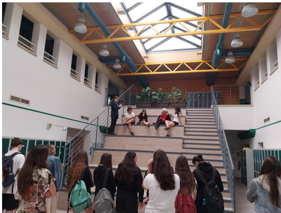
Breaktime poetry analysis!