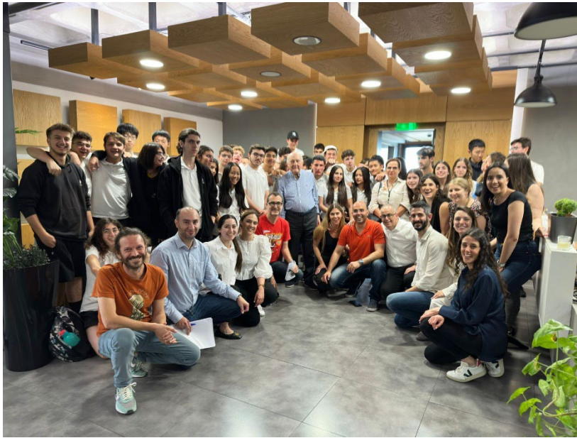
Staff, students and Alphamega staff at the end of an immensely productive day!