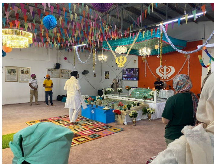
Inside the Sikh temple where the Baba Ji (revered father) stands before the holy book