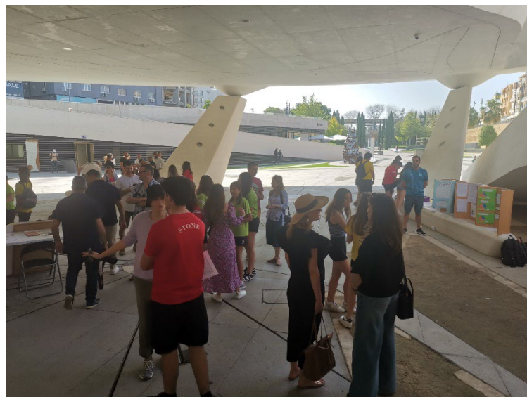
Multiplier project event in full swing in the 'moat'