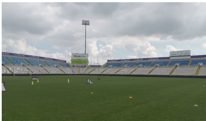
The hallowed turf of the GSP set up for our young football stars