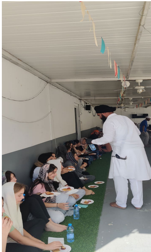
The Baba Ji, along with other members of the Sikh community, serves staff and students a breakfast of fried bread coated in chickpea batter, a cup of tea and water.