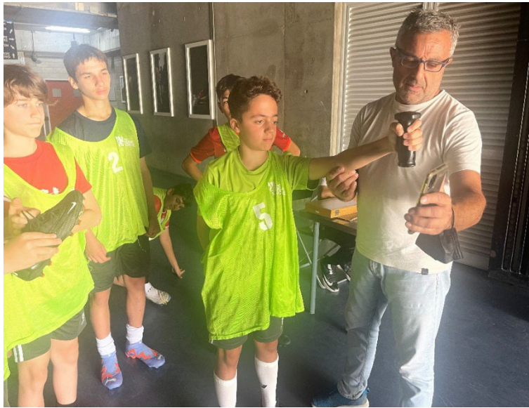
Health and fitness tests a priority