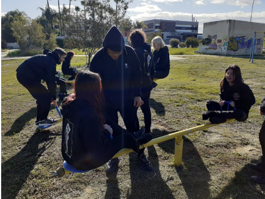
Who said playing in the park is just for small kids?