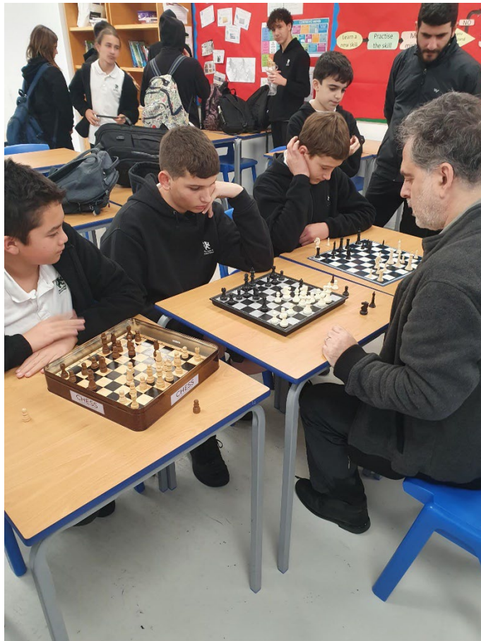
A battle of wits!