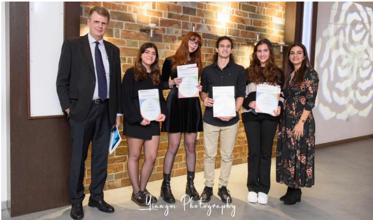
An evening of celebration