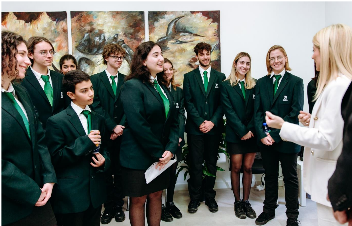
Imparting words of advice to our student leaders