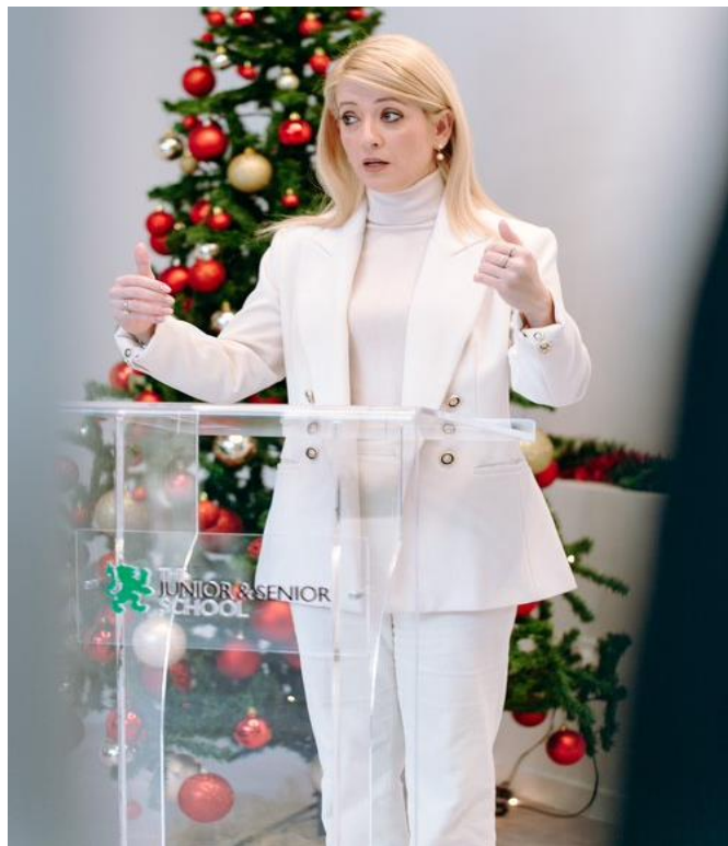
Ms Annita Demetriou delivering her speech in the new Library