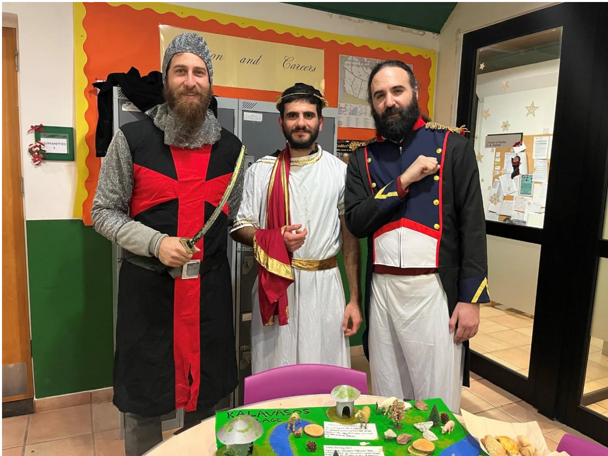
Open Day 2022: Now, who might these gentlemen be?