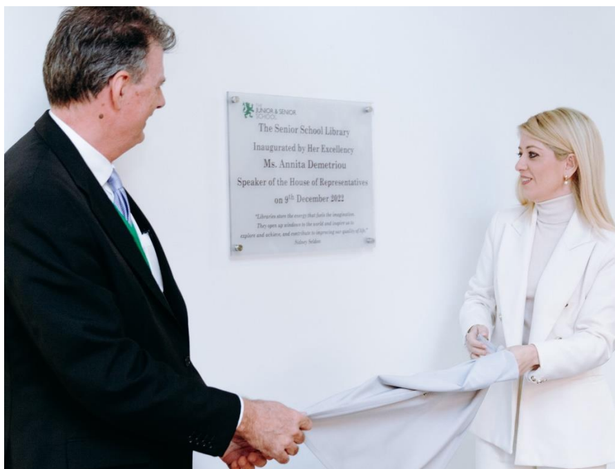
And the unveiling of the commemorative plaque