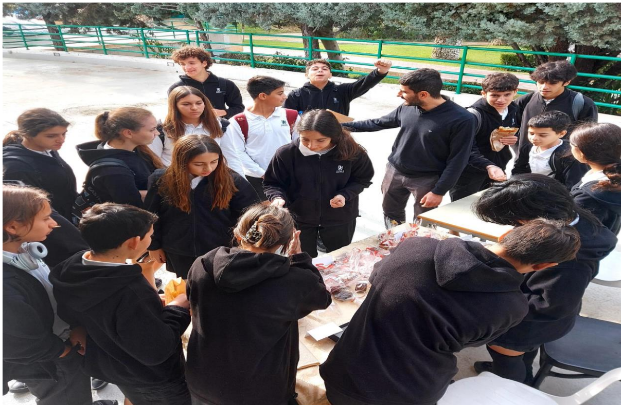
Year 8 Bake Sale - open for business