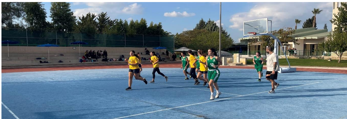
Our KS3 girls compete against ES in basketball

The School recently welcomed student teams from the English School to play friendly basketball, futsal and volleyball matches on our site. This was a great opportunity to offer competitive practice to students as well as to foster mutual collaboration between our two schools.