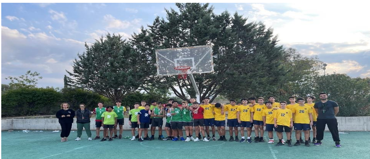
KS3 boys from both schools with their coaches