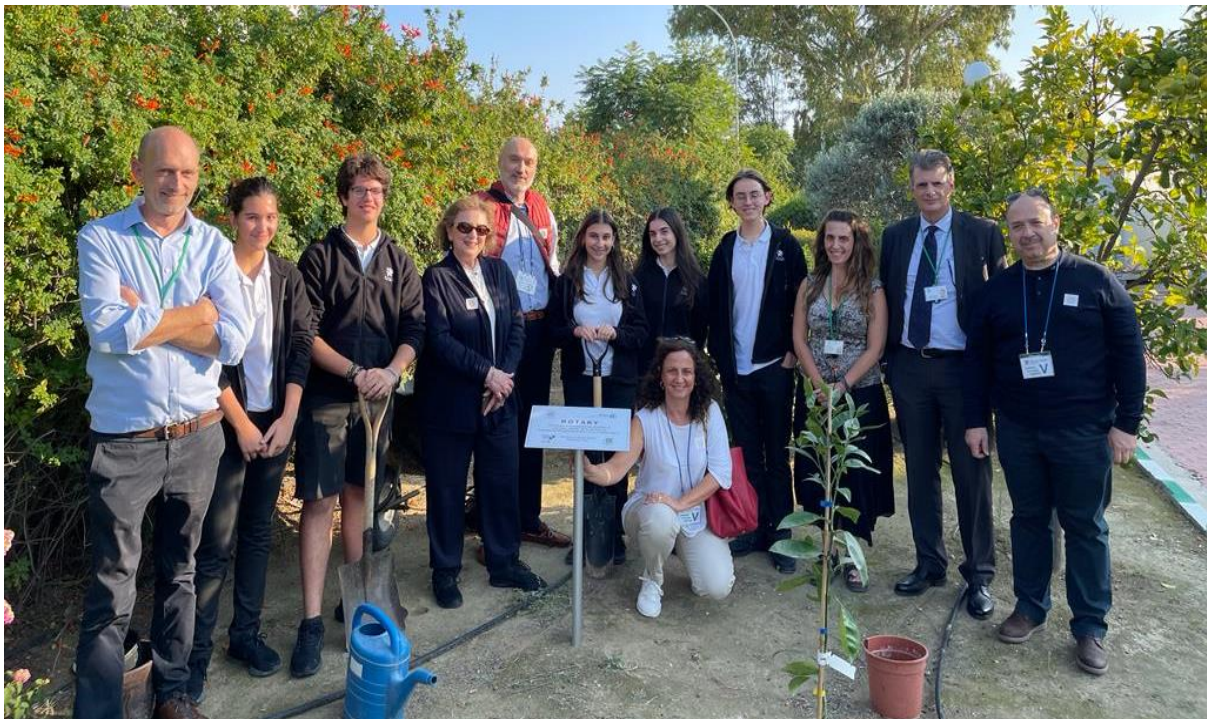
Rotary Club members, ECO Club students and staff record the day