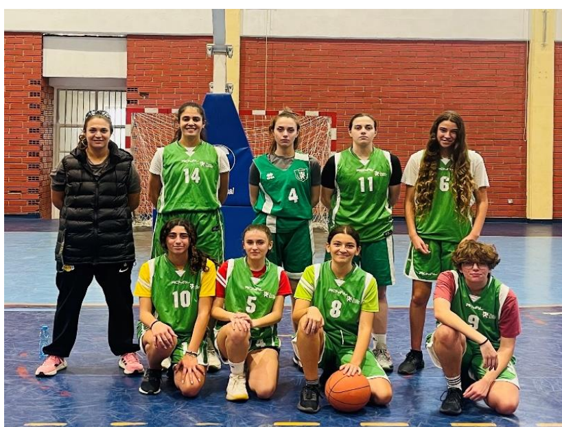
Well done, team!