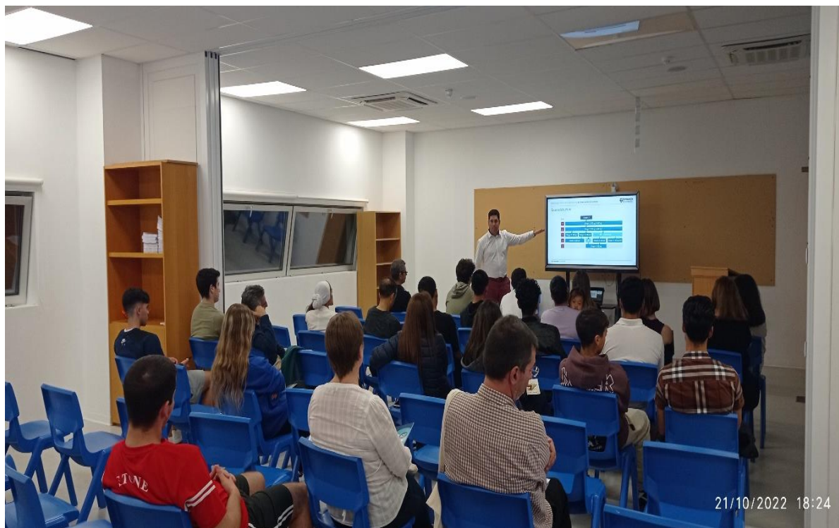
Presentation on the study of Chemical Engineering at the University of Newcastle