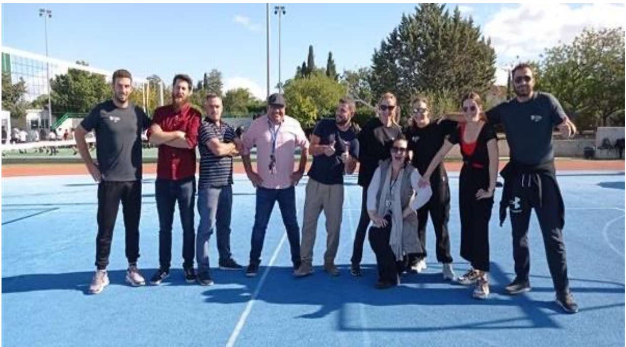
Team teachers, fired up for the next match!