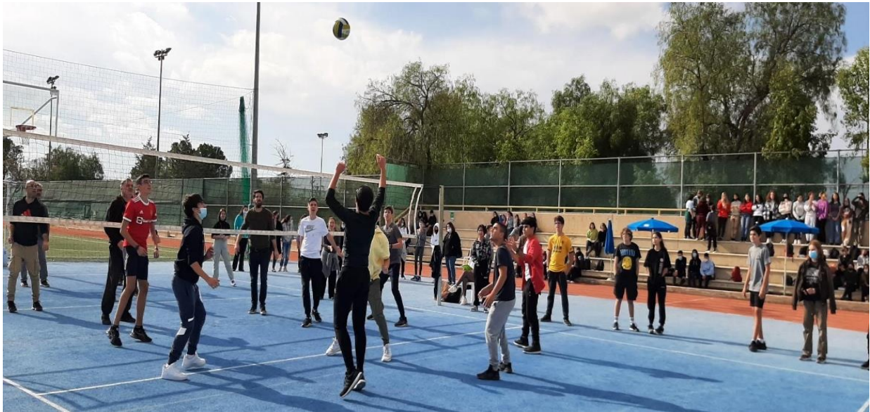
Students vs teachers on the volleyball court

It may interest you to learn that not only do we encourage sporting success for our school through competition locally and nationally, but we also foster gamesmanship during the school day: Every Friday, during second break, the Senior School organizes an in-school tournament involving teachers against students in volleyball and basketball.