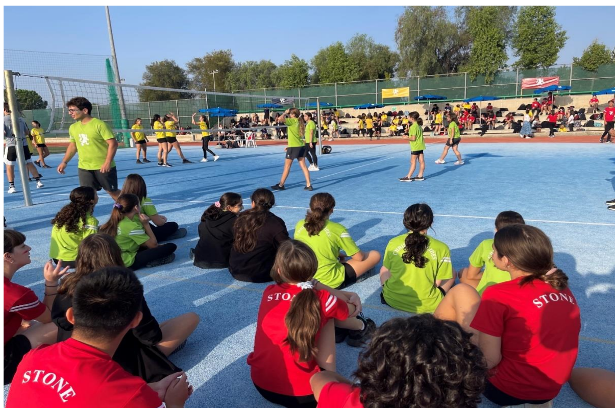
House team members at the volleyball court

The Senior School celebrated the founding of our school in a series of sporting and team building activities on the last day before half term. It was a morning packed with activity which included the normal fayre of team sports along with tug of war and other fun pursuits! Inevitably, a teachers vs House Captains tug of war was fought, and despite our best efforts, teachers were unable to overcome the overwhelming might of students. Medals were awarded and birthday cake consumed, and with almost pre-ordained timing, we were able to conclude all events just before the sky darkened and a light drizzle sprinkled the sports areas.