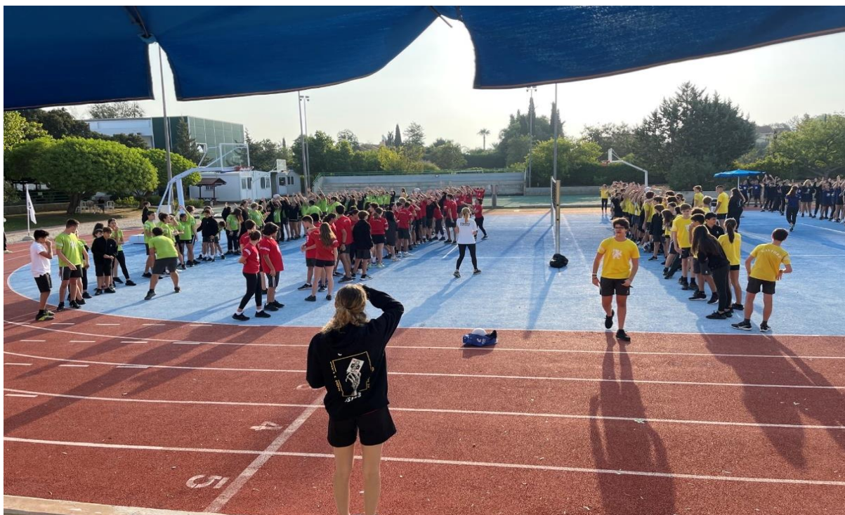
Team building for KS3