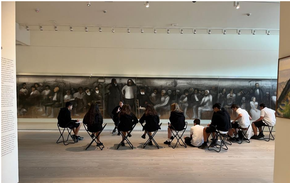
The remarkable ‘People of Cyprus’ work intriguing our Year 10s