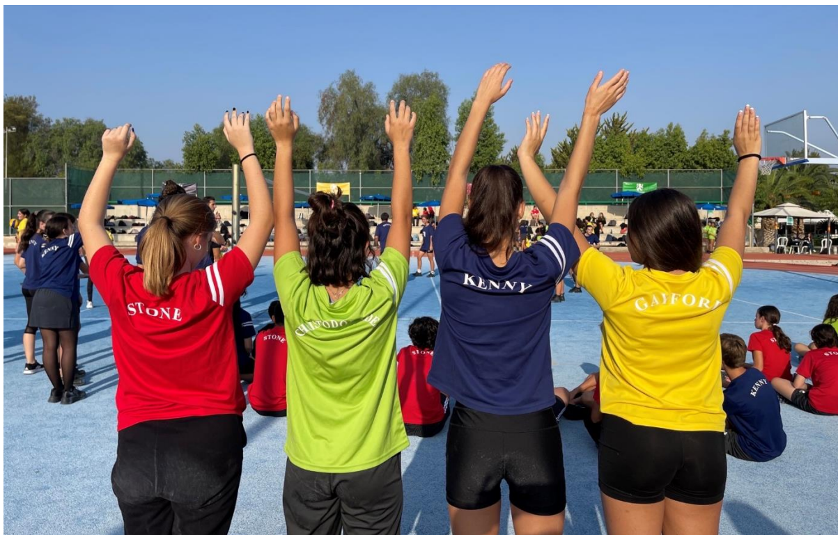
Fair play and pride in the legacy of their House names