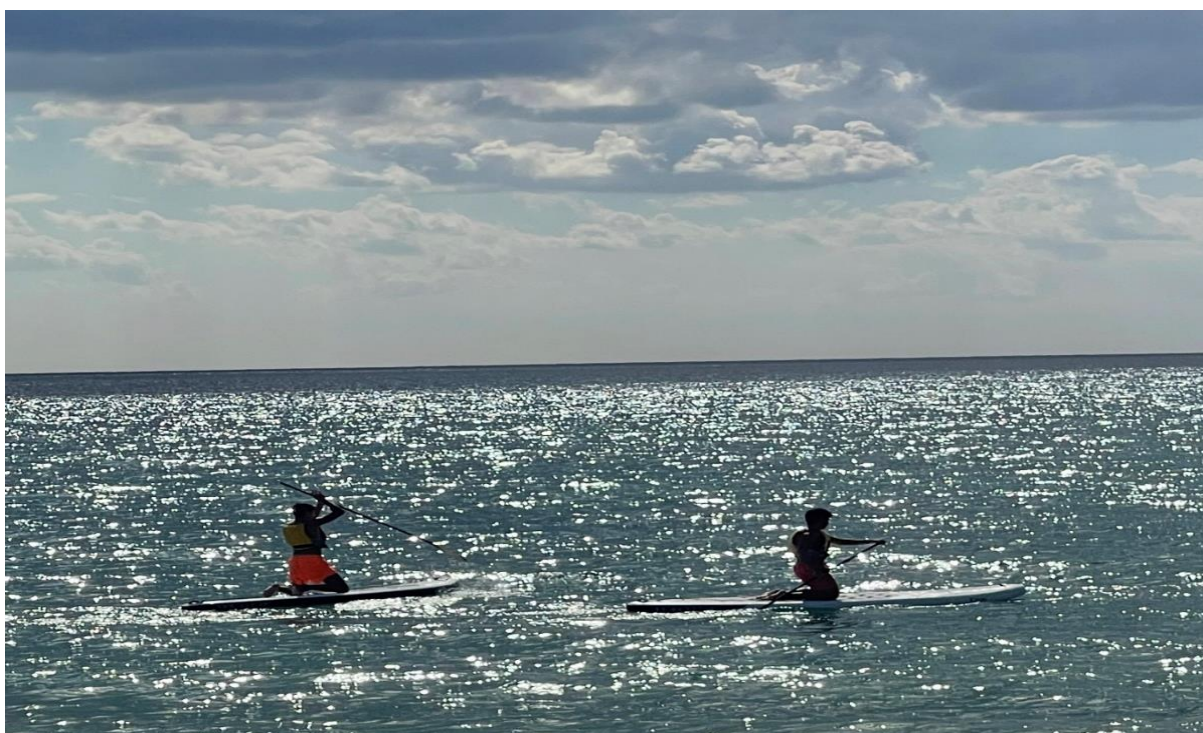
Year 11s take to the surf

Y11 IGCSE PE students travelled to Kahuna Surfhouse in Larnaca and had the opportunity to try surfing, stand up paddle (SUP) and took part in team building activities. Reports suggest that they all benefitted immensely and had the chance to observe how risks are assessed before water activities as well as learning about the measures taken to ensure safety in water sports – a topic directly linked to their syllabus in PE.