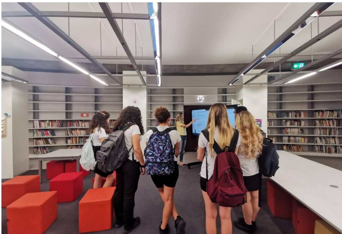
Our EPQ students 'on tour'