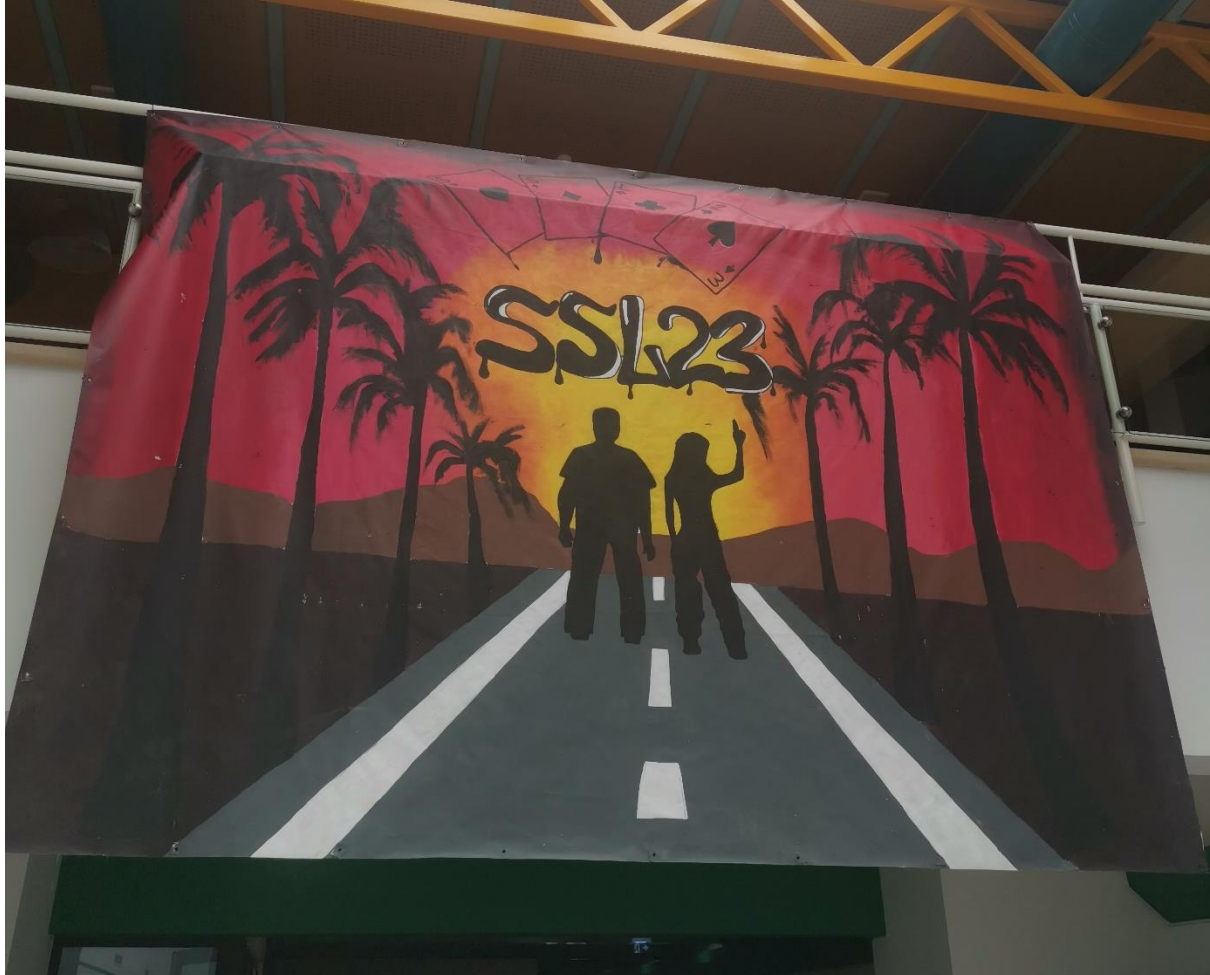
Year 13's banner to mark their final year...The road is long...